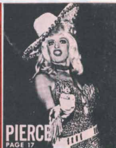
PIERCE PAGE 17