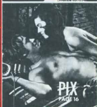
PIX PAGE 16